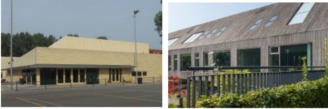
KRAAIJVANGER ARCHITECTS © RONALD TILLEMA ILLUSTRATION OF WEATHERING OVER TIME

Testing of a small area before full use is recommended. Note that some products may bleach the wood if over applied. For more details on cleaning Accoya cladding, please refer to our Wood Information Guide.