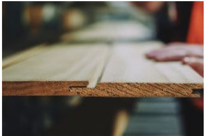
EXAMPLES OF GOOD DESIGN PROFILE