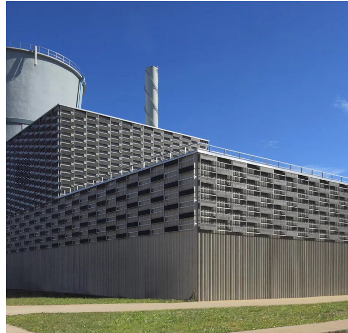
Accoya facade panels coated in TEKNOL AQUA and NORDICA EKO