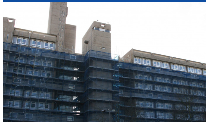
2012 Carradale House, UK