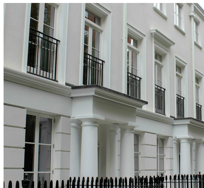
Accoya windows coated in ANTISTAIN AQUA and AQUATOP

Visit www.teknos.com for information on coating and maintenance systems and to find your nearest Teknos representative