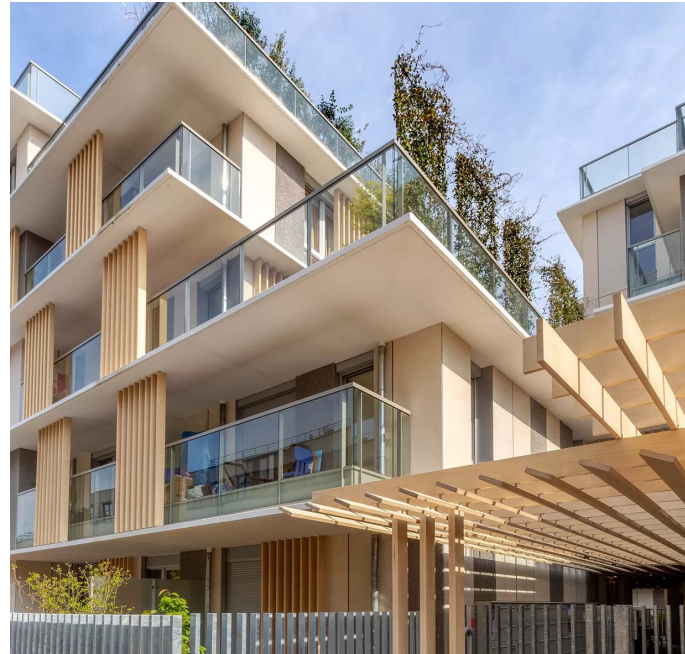
Accoya sunshades coated in AQUAPRIMER and AQUATOP