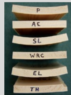
Accoya was the only wood that did not cup in this BM Trada trial. From top to bottom: Pine, Accoya Wood, Siberian Larch, Western Red Cedar, European Larch and Thermowood.